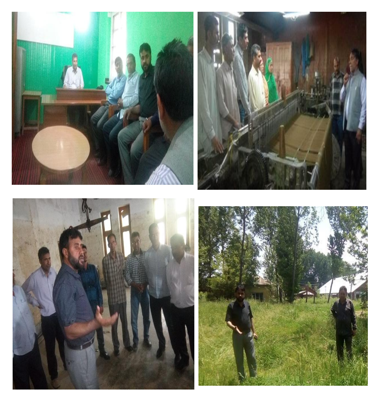
Figure 4.1: Photographs of Consultation at Govt. Woollen Mills Bemina