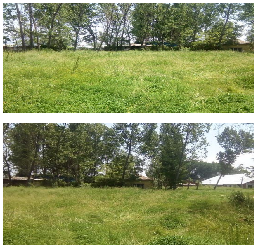
Figure 2.1: Photographs of Topography & Physiography of the Site

22. The subproject area is located in southwest direction of the Srinagar city. Physiographically, Srinagar city constitutes a part of the flood plain of Jhelum, which is largely flat and featureless with sub-recent alluvial deposits. The topography shows gentle terrain slope from East to West. General elevation of the subproject area varies between 1,585m and 1,590m above mean sea level. The area is flood prone and in September 2014 divested flood was experienced in the River Jhelum. The photographs of topography and physiography of the site are given in Figure 2.1 .