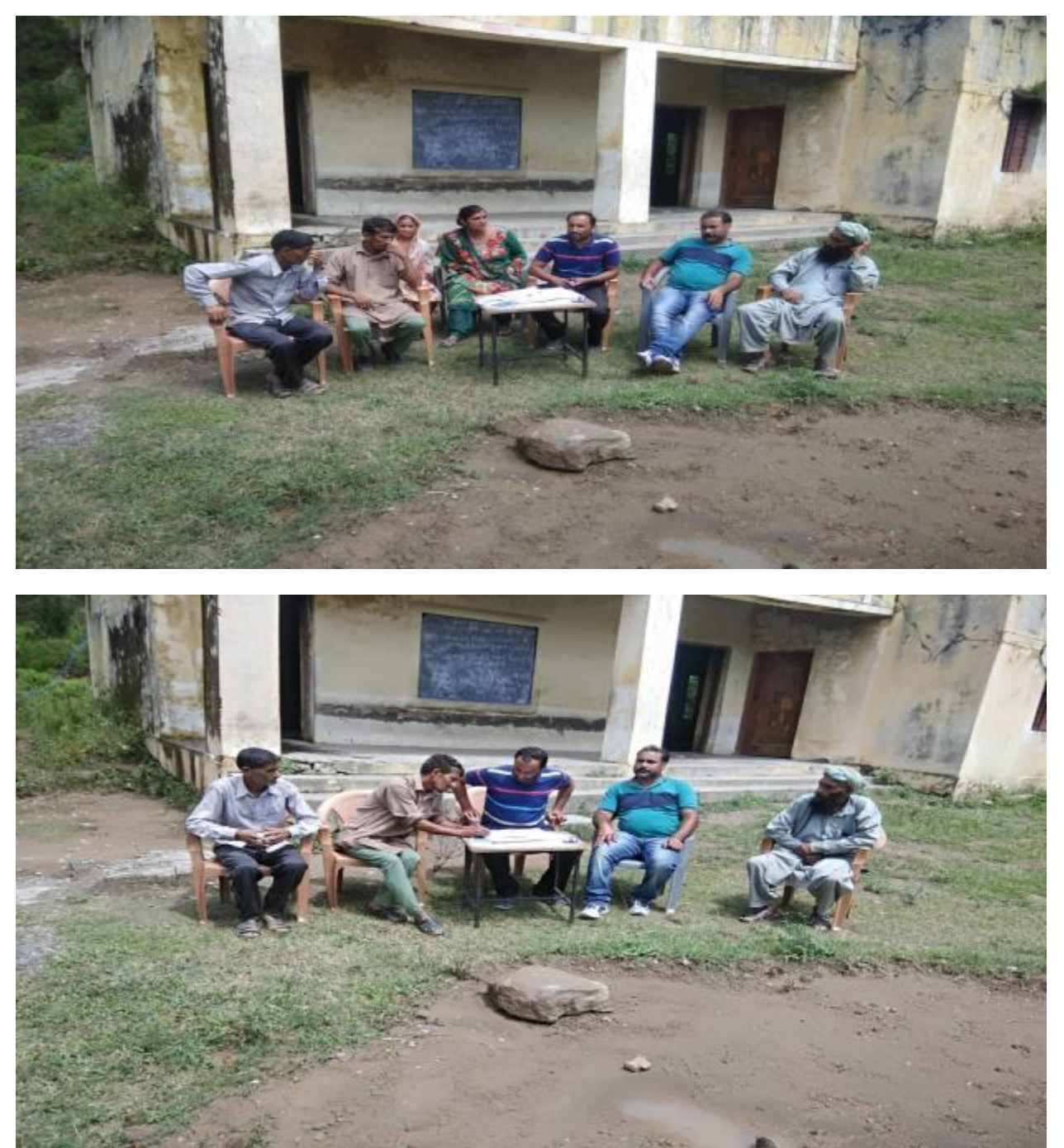
Appendix D: Photographs of Public consultation Photographs