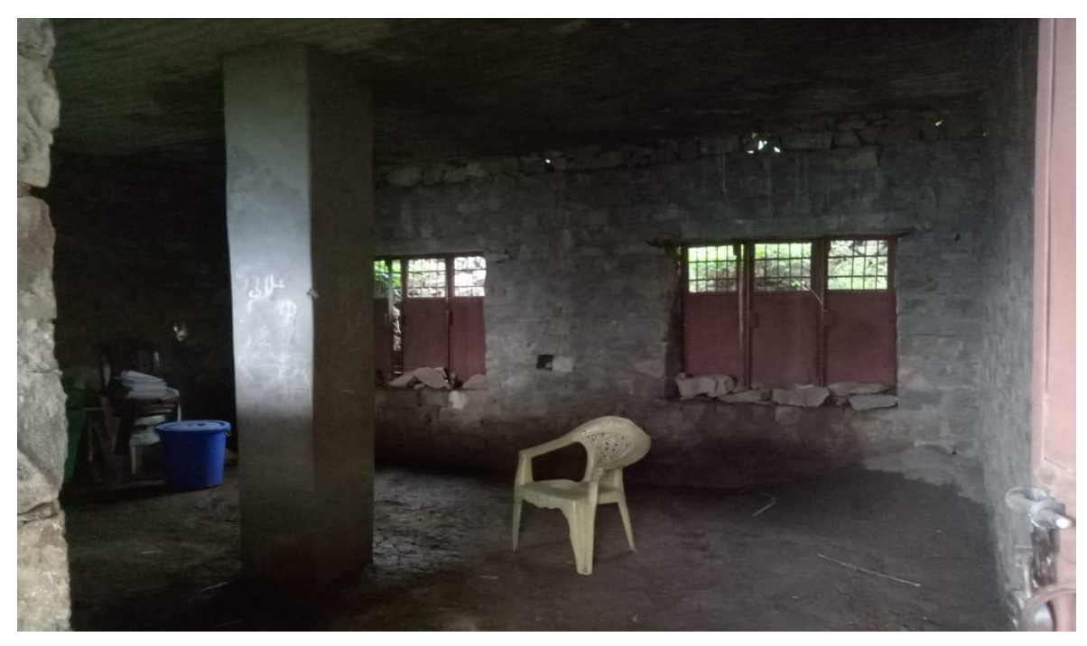
Photographs of damaged building and Classes running outside school