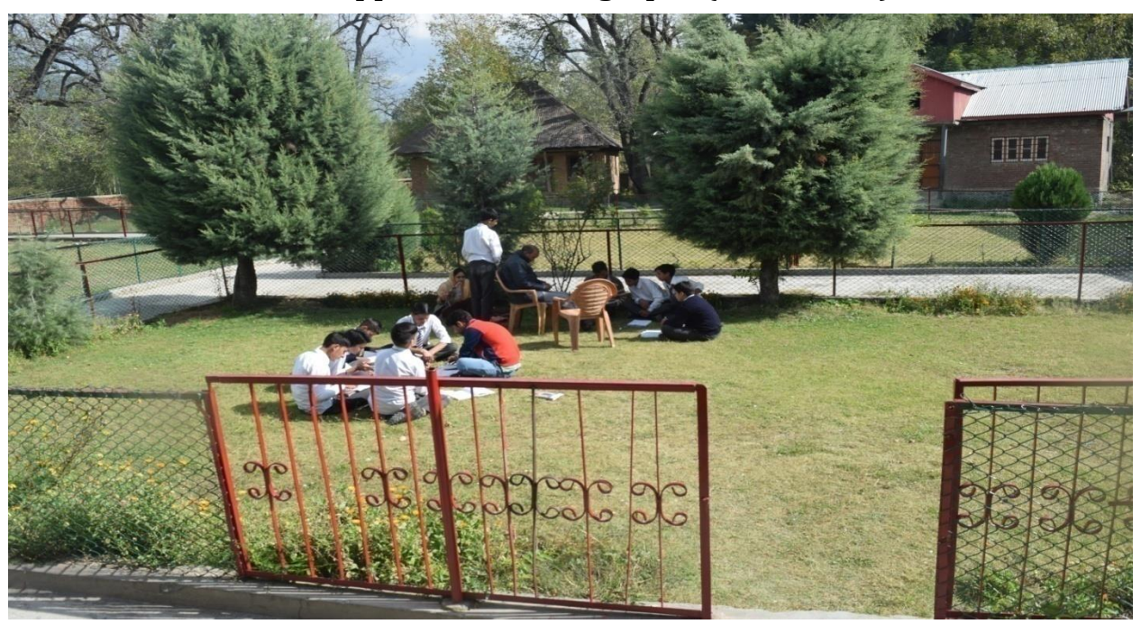
Figure 2: Individual Consultation