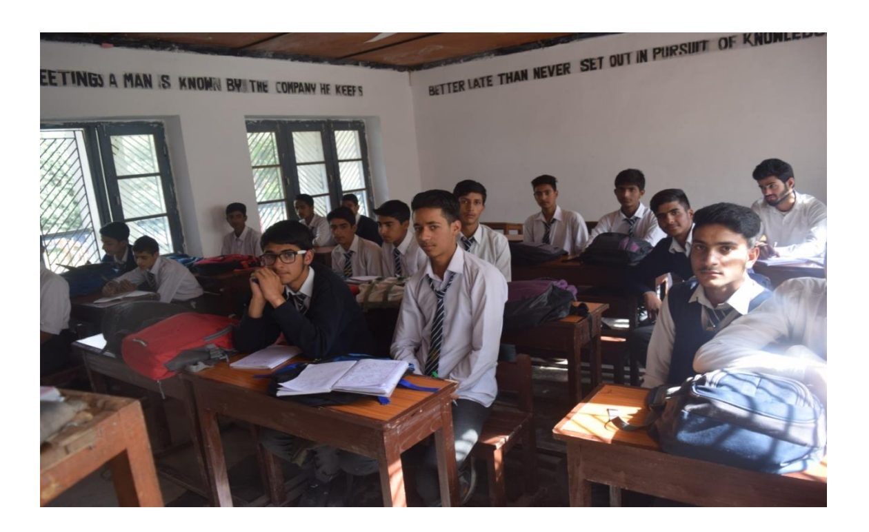
Figure 3: Interaction with students