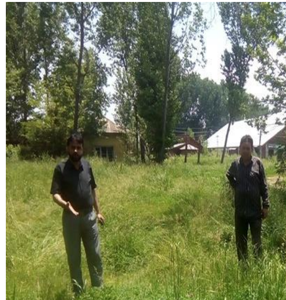
Figure 4.1: Photographs of Consultation at Govt. Woollen Mills Bemina