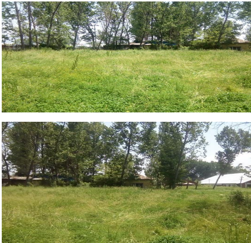
Figure 2.1: Photographs of Topography & Physiography of the Site