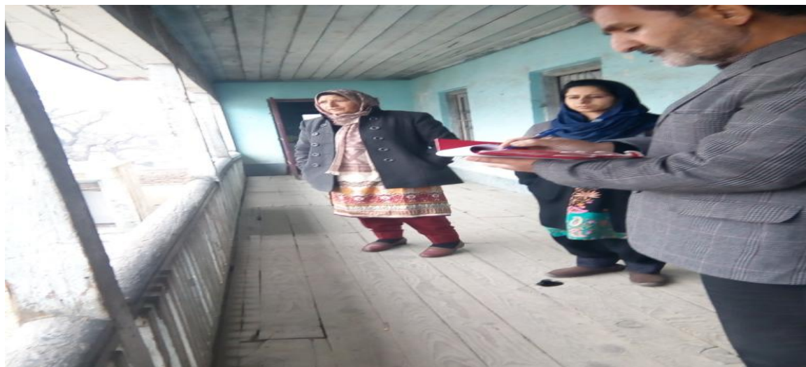
Consultation with School Staff 1