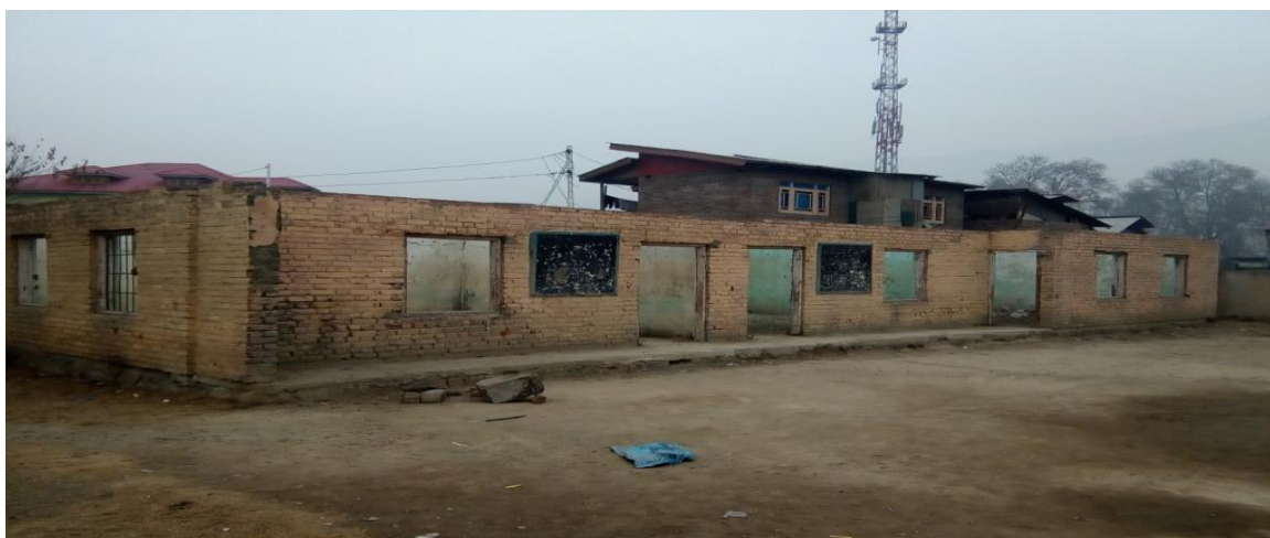
Existing School Building to be Demolished