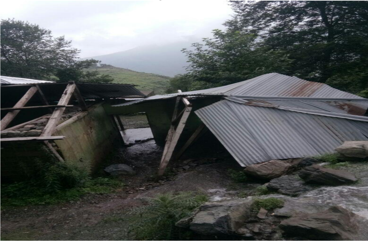
Damaged School Building