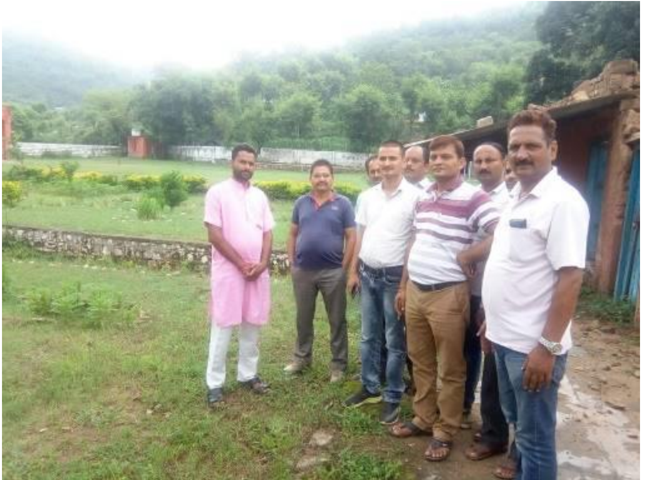
LIST OF PARTICIPANTS IN PUBLIC CONSULTATION WITH SIGNATURES