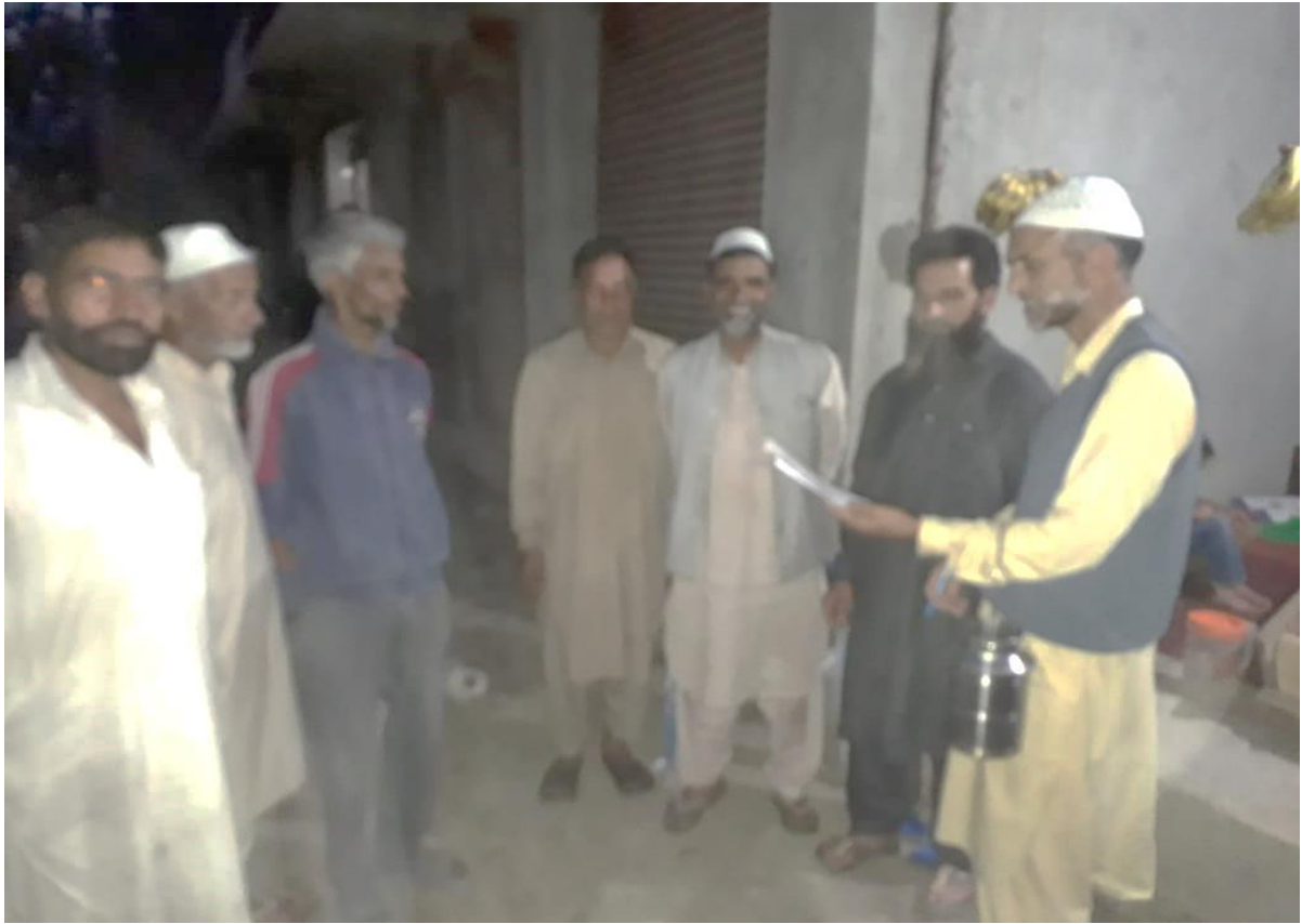
Consultation with Lambardar (16.09.2020)